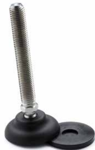
Art. P900 CIN