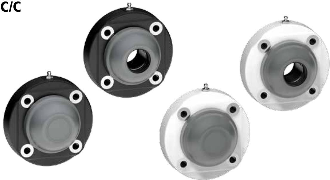
Full protection of bearing