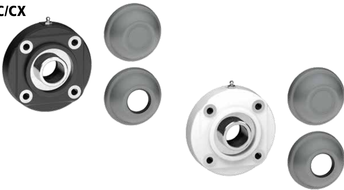
Without protection cover