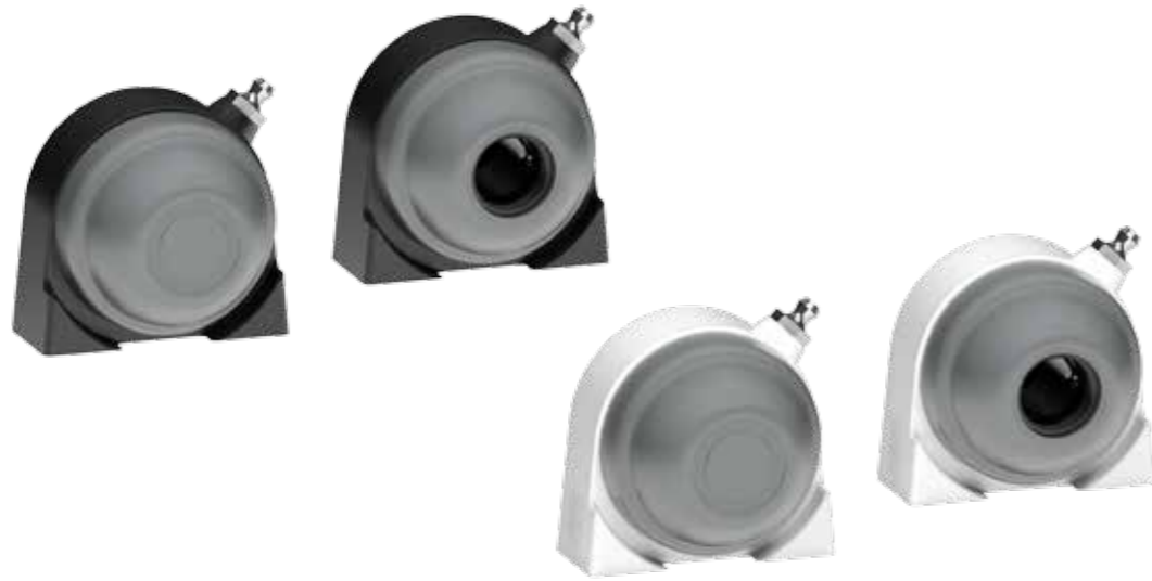
Full protection of bearing